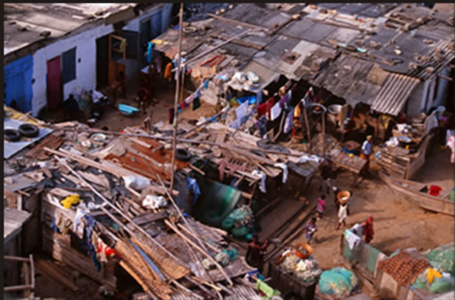
Shanties - West Africa